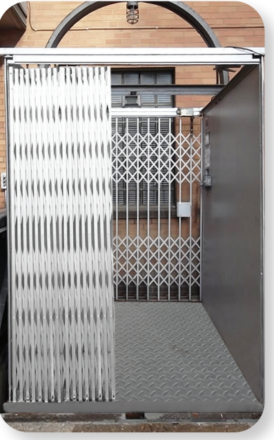
Commercial gate in Stainless Steel

For more information on custom options please reach out to Enterprise Customer Service at 309-689-2584.