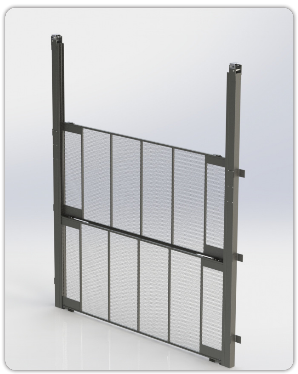
Two speed lift-up gate in closed position

Enterprise Elevator Products Advantages: