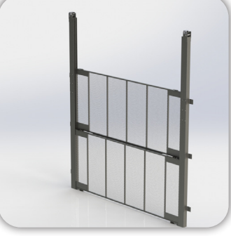
Two speed lift-up gate in closed position