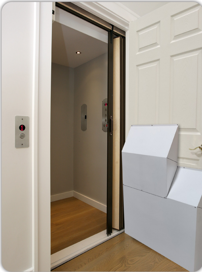
Metal space guard