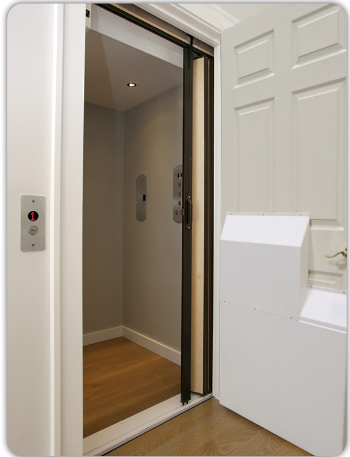
Plastic space guard

©2022 Bella Elevator LLC. All rights reserved E103. 11/22