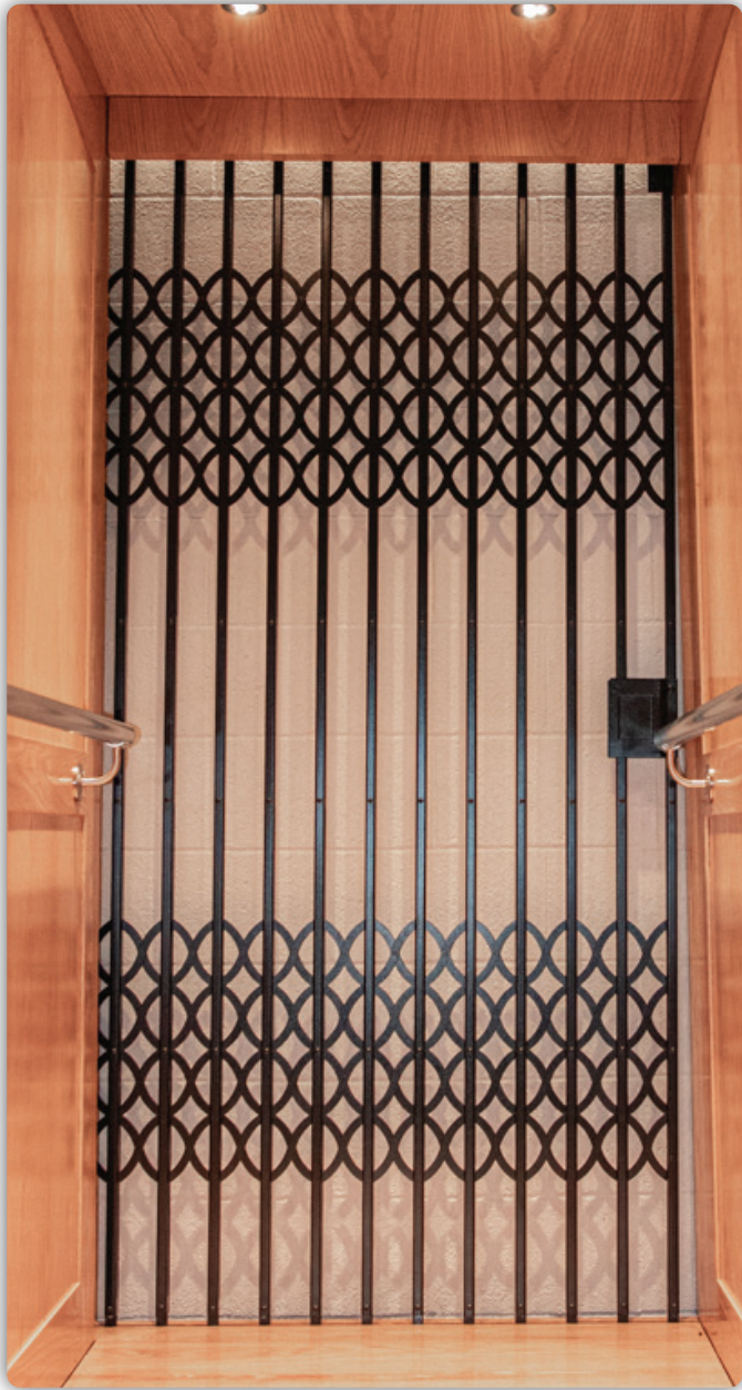
Black with Diamond and Pearl configuration