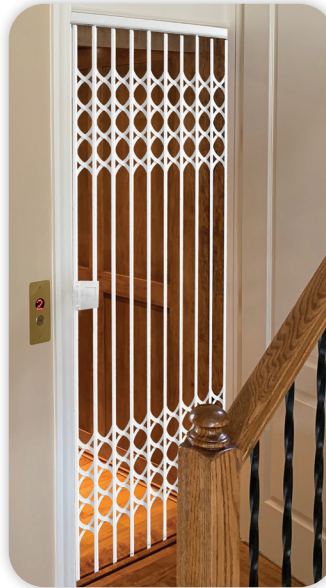
Architectural White with Pearl configuration