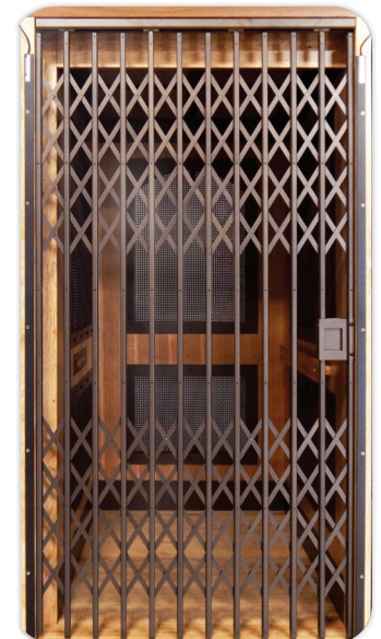
Vintage Bronze with Classic configuration

The Enterprise Collapsible Gate is designed and manufactured to comply with current codes. Choose from a wide variety of attractive finishes and colors to ensure the perfect fit. Configurations available include Classic, Pearl or Diamond and Pearl.