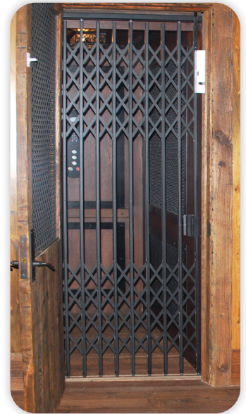
Black with Classic configuration