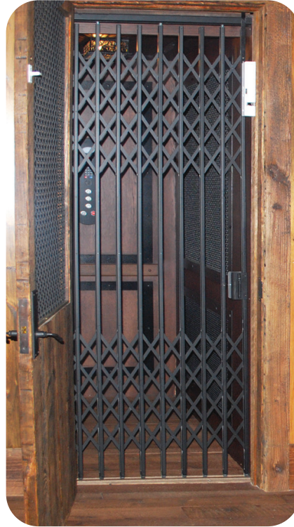
Black with Classic configuration