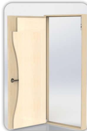
Wood space guard at full height