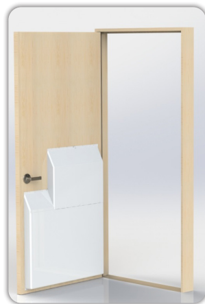
Plastic space guard at 36"