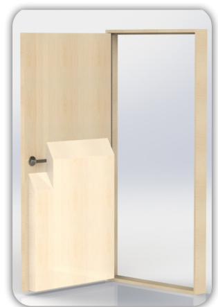
Wood space guard at half height