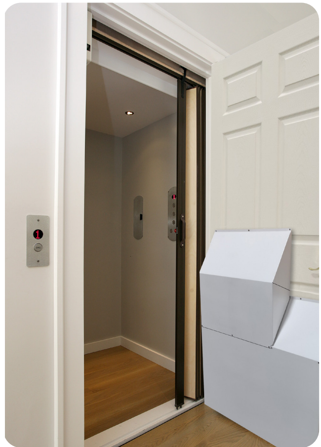
Metal space guard