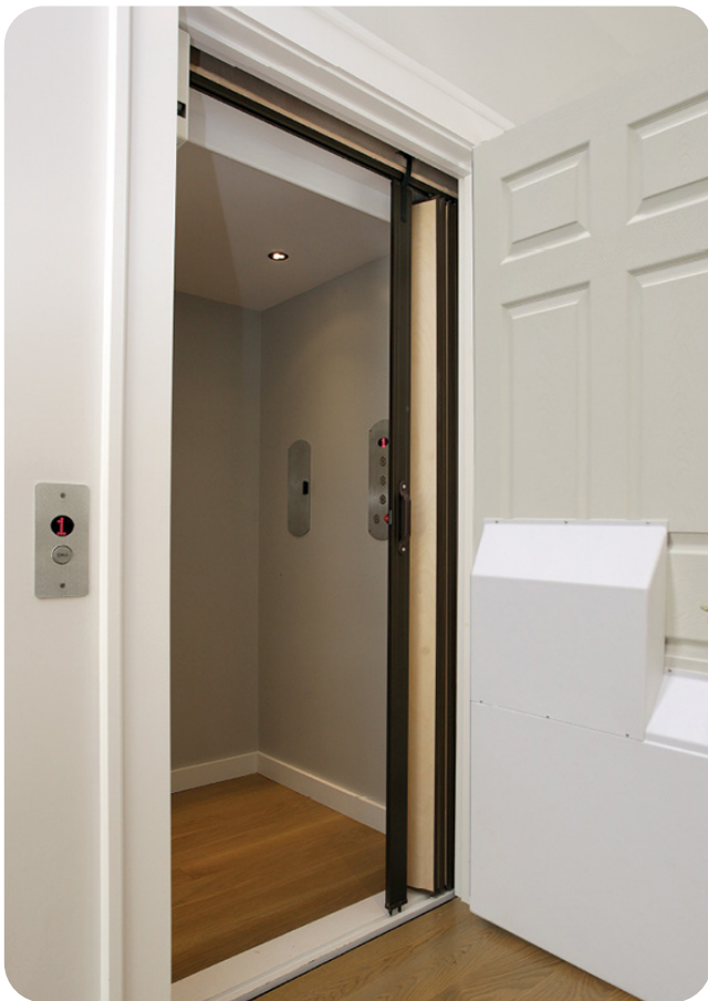
Plastic space guard